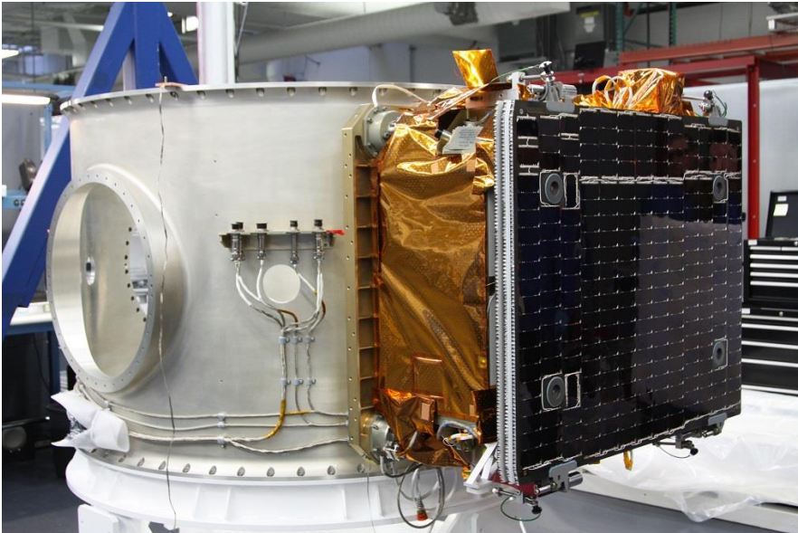
ORBCOMM's OG2 satellite mated to the Moog ESPA ring.

ORBCOMM anticipates launching the remaining eleven OG2 satellites and enhanced OG2 services in the fourth quarter of 2014 to complete its next generation constellation.